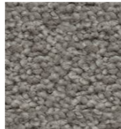
845 Glacier Blue