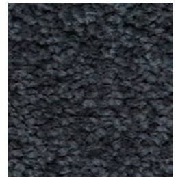
890 Midnight Blue