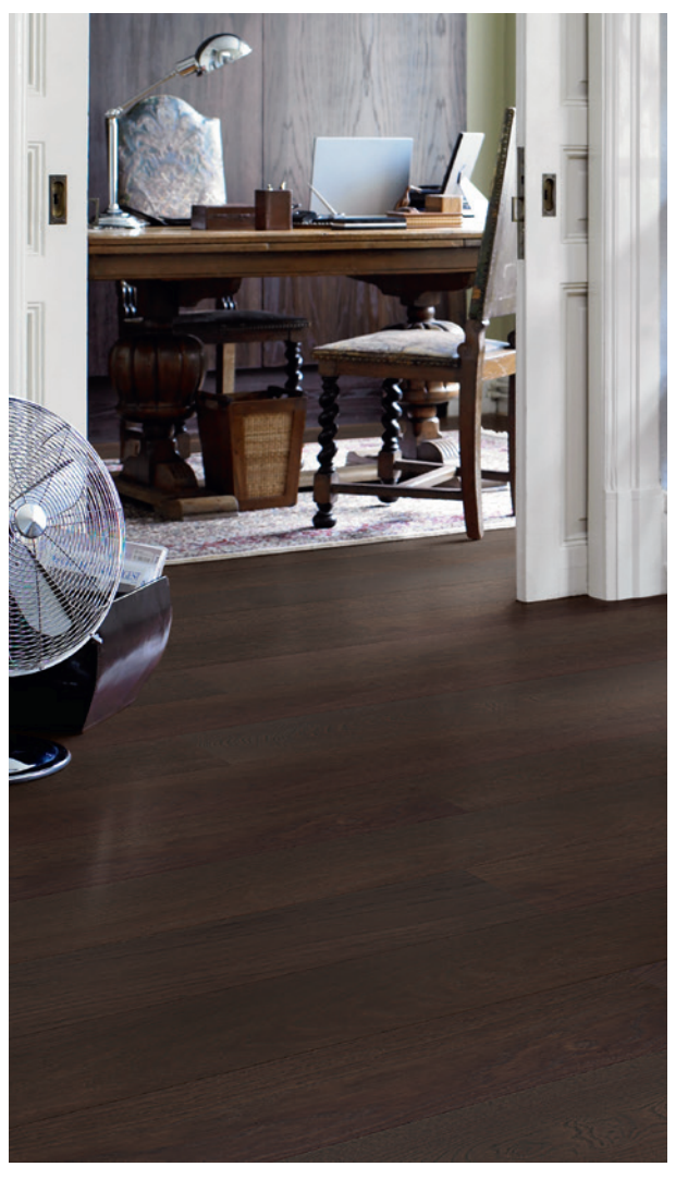
BROWN CABIN OAK 03888