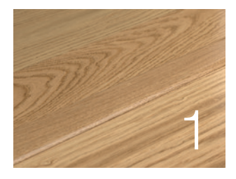
T-moulding From wood to wood.

Pergo 5-in-1 offers different moulding solutions for different parts of your floor, all wrapped up in one handy package. The mouldings match your floor perfectly in colour, as well as in texture, and the one-piece solutions give a seamless installation result. The surface is made of wear and scratch-resistant veneer. The core consists of HDF and the bottom rail is made of plastic. With the patented Incizo® solution, you easily cut the moulding to the shape you need. Knife is included. Suitable for flooring heights between 12.5 and 14 mm.