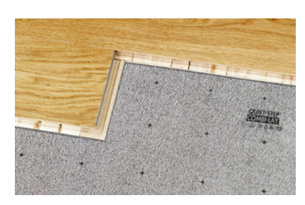
Combi-Lay Standard C-LAY20FS; C-LAY50FS 20/50m² roll Thickness 2mm

Combi-Lay Standard is no normal underlay. The dense, closed cell polyolefin foam provides excellent support, with good reduction of both reflected and impact noise.