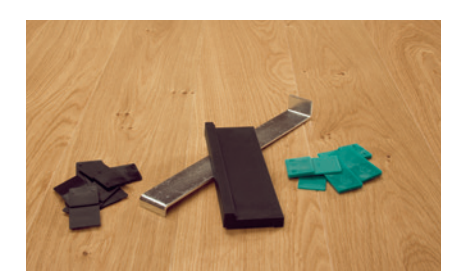
Installation kit PGTOOL 0/50m² roll Thickness 2

Everything you need in one box. Contains tapping block, installation spacers in two sizes (2 \times 18 = 36 \text{ pcs}) and a pull bar.