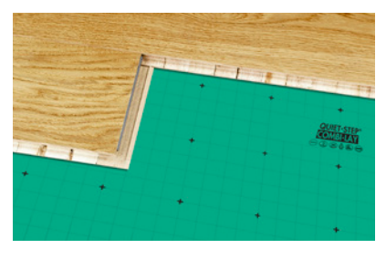
Quiet-Step Combi-Lay QSC-LAY20FS; QSC-LAY50FS 20/50m² roll Thickness 2mm

Combi-Lay Standard is no normal underlay. The dense, closed cell polyolefin foam provides excellent support, with good reduction of both reflected and impact noise.