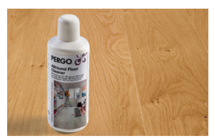
Allround Floor Cleaner PGCLEANALL1000

Specially developed for cleaning laminate wood and vinyl flooring. Ideal for removing dirt, grease spots and heel marks, as well as for daily cleaning.