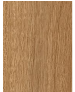
556 Spotted Gum