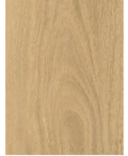
525 Alpine Gum