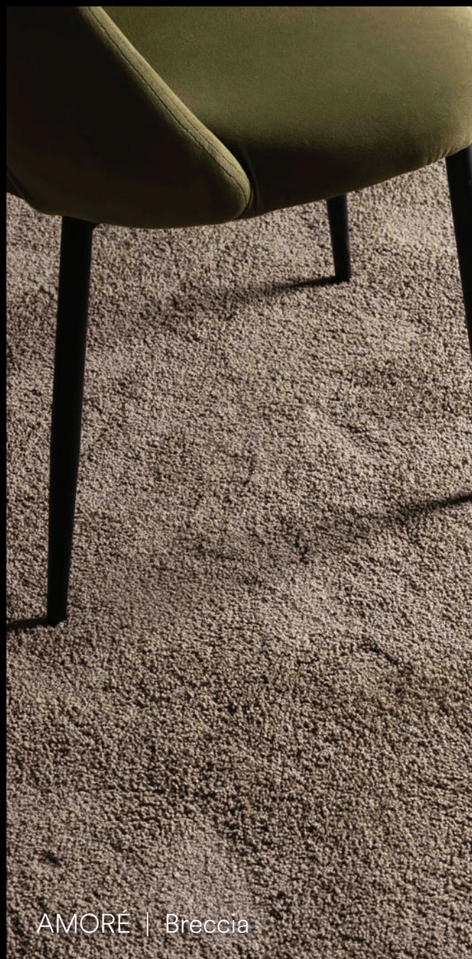
AMORÉ | Breccia