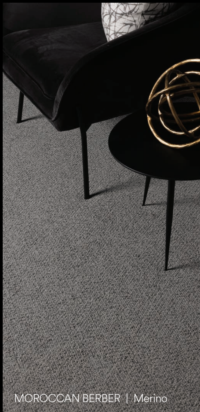
MOROCCAN BERBER | Merino