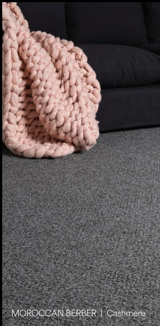
MOROCCAN BERBER | Cashmere