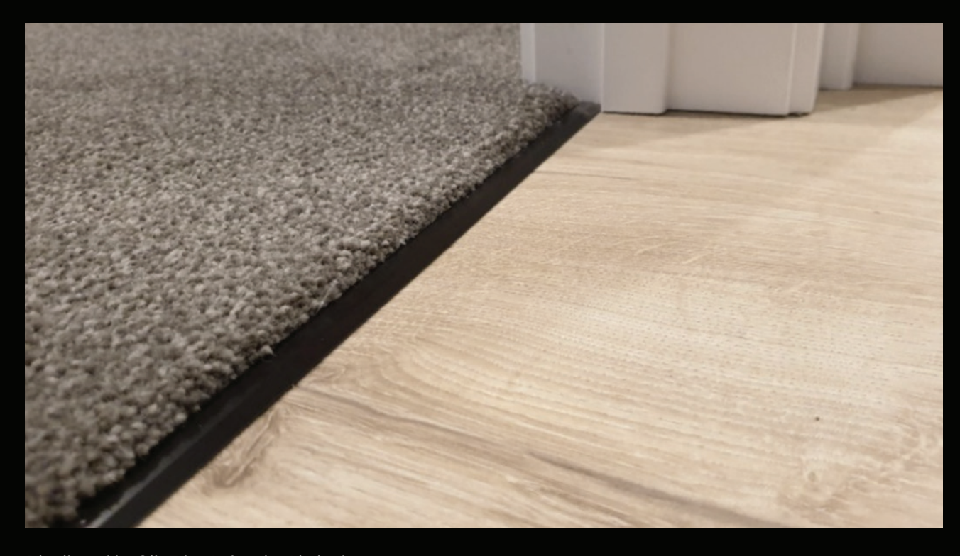
Distributed by Gilt Edge Industries Limited.