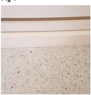
After fitted any excess silicone that squeezes up is removed

If any of these guidelines are not followed, a warranty claim may not be accepted.